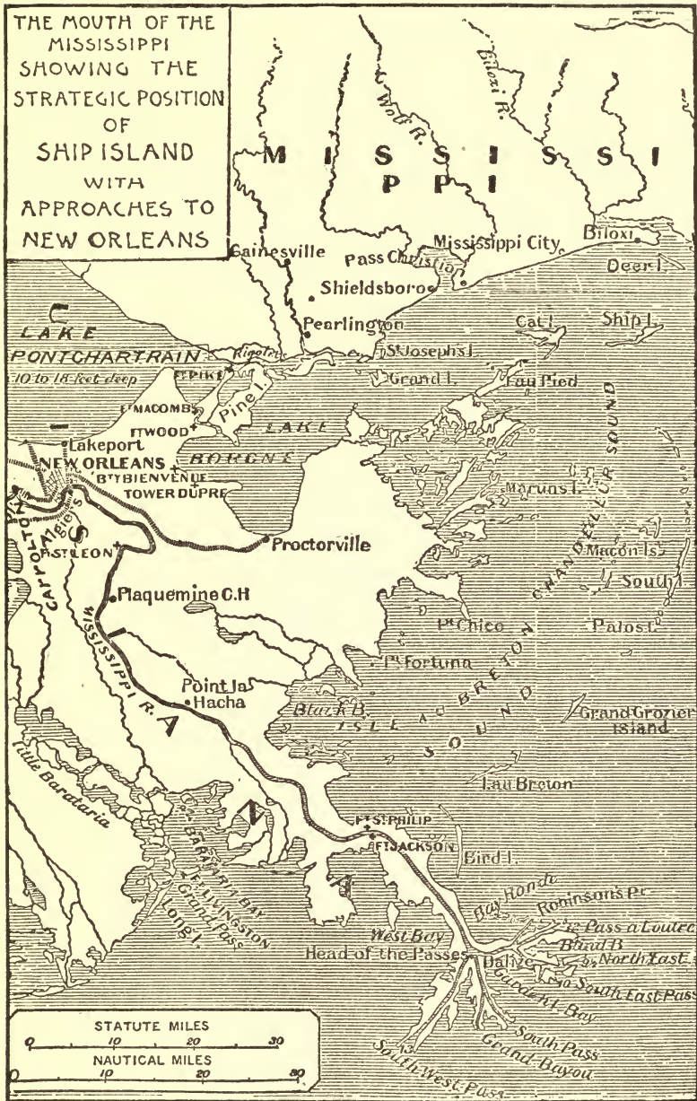
MAP OF LOWER MISSISSIPPI RIVER

THE MOUTH OF THE MISSISSIPPI SHOWING THE STRATEGIC POSITION OF SHIP ISLAND WITH APPROACHES TO NEW ORLEANS